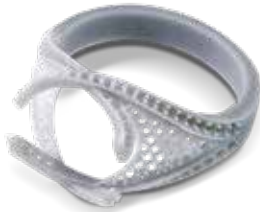
Figure 4 JCAST-GRN 10 produces accurate, reproducible, and highly detailed patterns for jewelry casting. This high contrast green material is easy to cast with minimal ash and residue, producing high quality jewelry pieces rapidly.