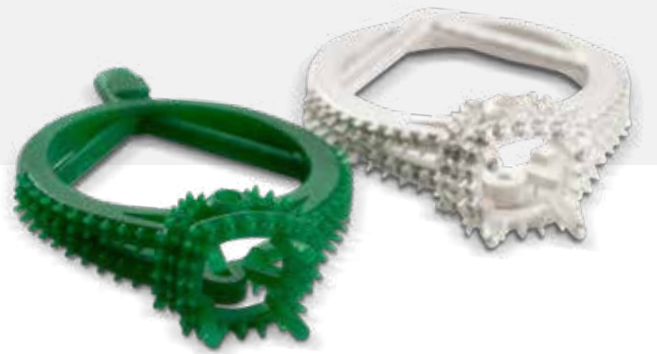
Figure 4 Jewelry

Create accurate, fine detail prototypes of jewelry designs for fittings and try-on, as well as to ensure the accuracy of stone settings.