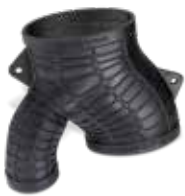
Figure 4 elastomeric materials are ideal for the production of functional rubber-like parts with excellent shape recovery, high tear strength, great for compressive applications and material malleability