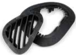
Figure 4 rigid materials produce durable plastic parts with the look and feel of cast urethane or injection molded parts, with features that include fast print speeds, high elongation, exceptional impact strength, humidity/moisture resistance, long-term environmental stability and more.