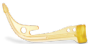
Figure 4 Production is compatible with 3D Systems' entire portfolio of NextDent® materials to facilitate full customization of dental devices. You can also choose from Figure 4 specialty materials for sacrificial tooling, jewelry casting, medical applications requiring biocompatibility and/or sterilization, and more.

See material selector guide and individual material datasheets for specifications on available materials.