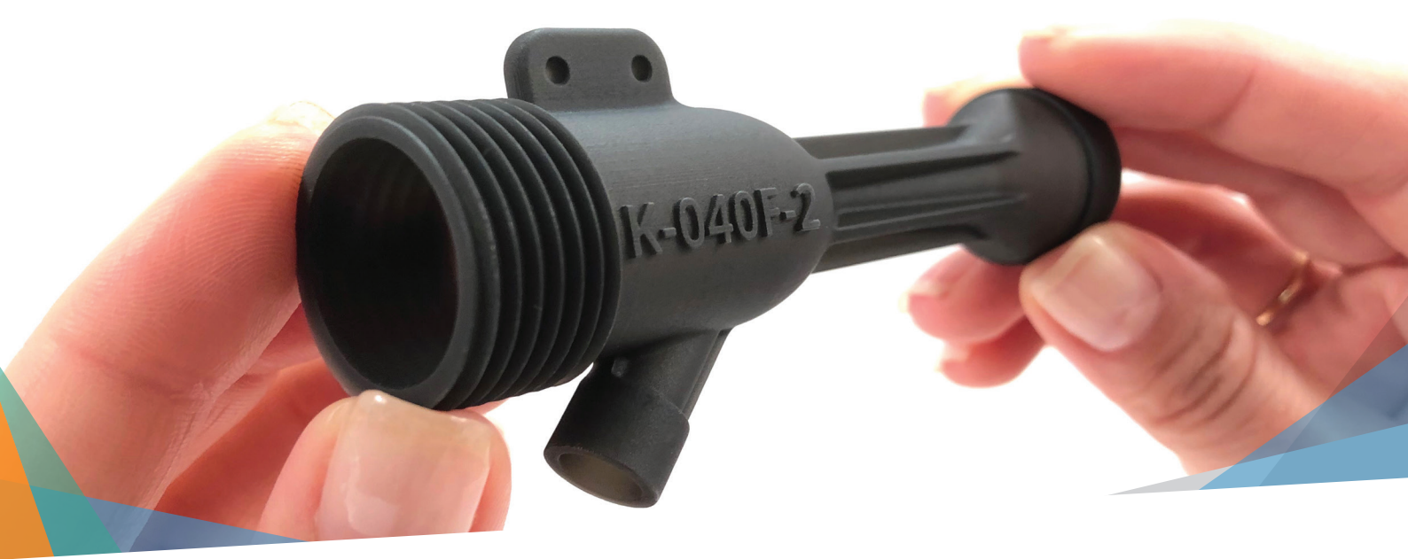
Figure 4™ TOUGH-BLK 20