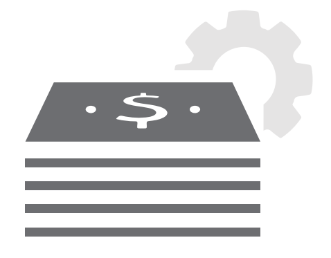
Reduce jigs and fixtures manufacturing cost by up to 10x

The costs saving of printing with FabPro is significant. The time saving is drastic. A typical aluminum-milled fixture costs about $450 and takes 3-5 days to produce. The typical 3D printed fixture costs about $45 and can be printed in less than a day, with no additional time needed for complex geometries vs. simple ones. That is a cost savings of 10 times!