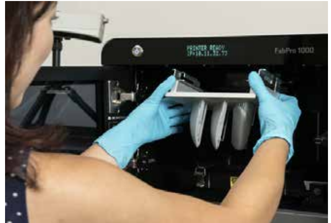
This desktop powerhouse packs industrial durability and reliability into a rugged yet compact platform.

FabPro 1000 will help shepherd the manufacturing process as ideas are validated and brought to production. FabPro 1000 assists engineers in creating accurate, functional prototypes that look and perform like final products. This makes it easier to verify the design, fit, function, and manufacturability before investing in expensive tooling and moving into production, when the time and cost to make change becomes burdensome. FabPro 1000 will quickly deliver functional prototypes for real-life testing to assess how a part will function when subjected to its expected usage.