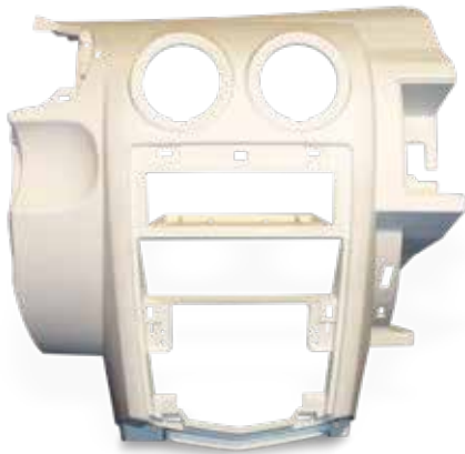
DuraForm PA Dashboard