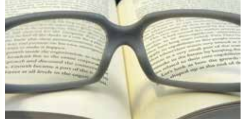
Visijet SL Tough (frame) and Visijet SL Clear (lenses)