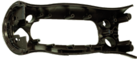
Visijet SL Black

The wide range of Visijet SL engineered materials offers the toughest and the highest quality parts to meet a broad range of commercial and production applications.