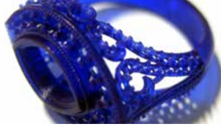
Visijet SL Jewel