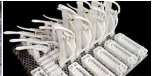
Visijet SL Impact