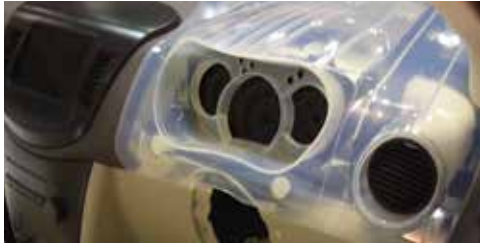
Various Accura materials for form and fit tests of a dashboard

Plastic and composite parts made from Accura SLA materials are the industry's gold standard for accuracy, providing excellent resolution, surface finish and dimensional tolerances. Accura SLA materials offer the broadest choice of materials in 3D printing and can easily be optimized for specific prototyping, casting, tooling and direct manufacturing applications.