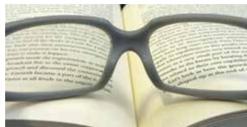
Visijet SL Tough (frame) and Visijet SL Clear (lenses)