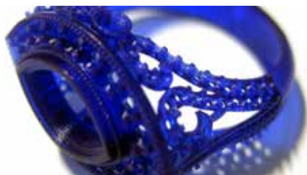
Visijet SL Jewel