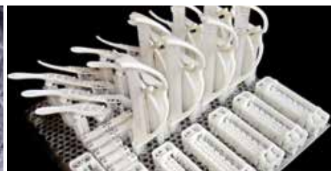
Visijet SL Impact