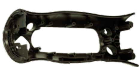
Visijet SL Black

The wide range of Visijet SL engineered materials offers the toughest and the highest quality parts to meet a broad range of commercial and production applications.