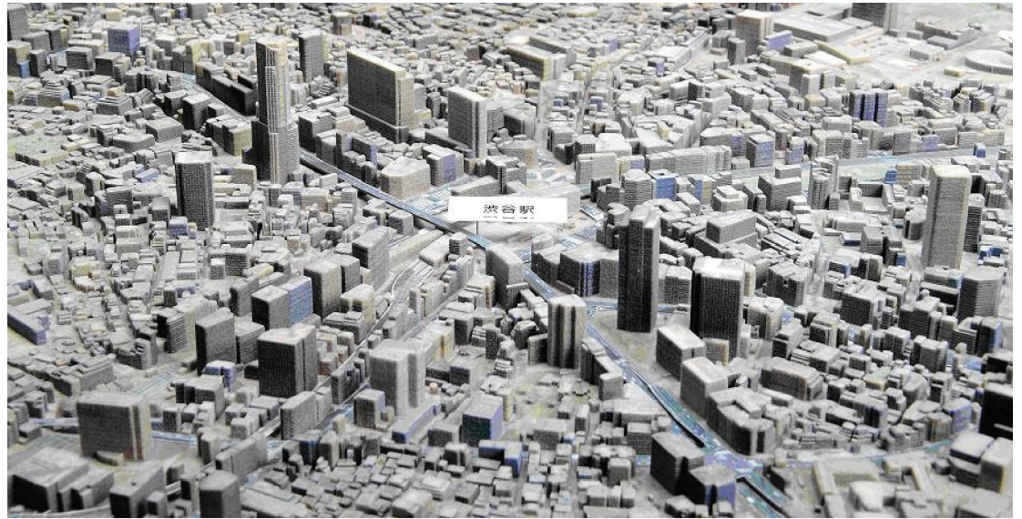
Topographic 3D model of Shibuya (provided by the Tokyo Digital Map Corporation)

For years, Trust System Corporation has been building accurate 3D models of cities and topographic features by using satellite terrain data, urban buildings data and other 3D data. The company developed its own CAD system and cutting tool to enhance the reproduction of topographic models, but realized that there were inefficiencies and workflow challenges in their operations. By adopting an engineering approach to using 3D digital data, Trust System has become an industry leader in creating accurate topographic models. The company now uses the Spectrum Z™510 full color 3D printer from 3D Systems to quickly create multicolor 3D models, and the process changes have resulted in increased client communication, fewer lost business opportunities and new value creation.