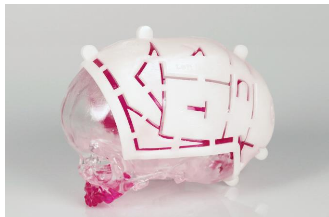
3D Systems VSP ® Cranial delivers patient-specific 3D printed marking guides to help transfer the virtual surgical plan to the operating room.

announced today the expansion of its groundbreaking Virtual Surgical Planning (VSP ® ) service to include VSP Cranial for cranial and craniofacial procedures. VSP Cranial is 510(k) cleared for use in the operating room and enables surgeons to create a virtual pre-surgical plan that can be instrumented with sterilizable, patient-specific 3D printed anatomical models, guides and templates. The use of VSP Cranial on these complex and sensitive procedures enables doctors to plan around and become familiar with a patient's specific anatomy, and is intended to facilitate the pre-surgical planning process as well as the transfer of that plan to the operating room. By supplying surgeons with informative digital tools and accurate 3D printed surgical guides, VSP Cranial is designed to help doctors deliver improved surgical outcomes.