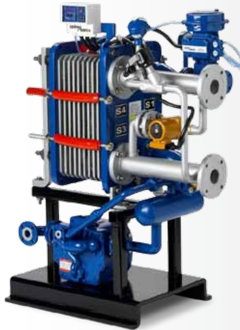
Spirax Sarco Inc. closed a $600,000 job with this 3D printed scale model of the EasiHeat heat exchanger

Spirax Sarco Inc., a firm that helps companies harness the power of steam, is now leveraging a second powerful technology – 3D printing – this time to improve its own business performance. A $100 million US subsidiary of UK-based Spirax Sarco Engineering, SSI is headquartered in Blythwood, S.C., and manufactures products for steam heating and process plants in a wide range of industries, from automotive to vegetable oil processing.