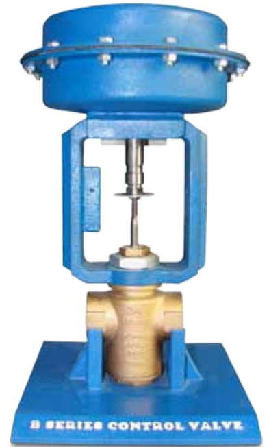
This model weighs six pounds instead of 40, making it easy for salespersons to tote to customer calls

“ZPrinting has become second nature – like printing off an email – it’s that convenient and that cheap. Printing off a part in 10 different design variations is nothing to us anymore. We’ve printed thousands of models. The part cost is so insignificant compared with the knowledge you gain. Somehow, wherever we decide to 3D print we see an improvement in business performance. We like that.”